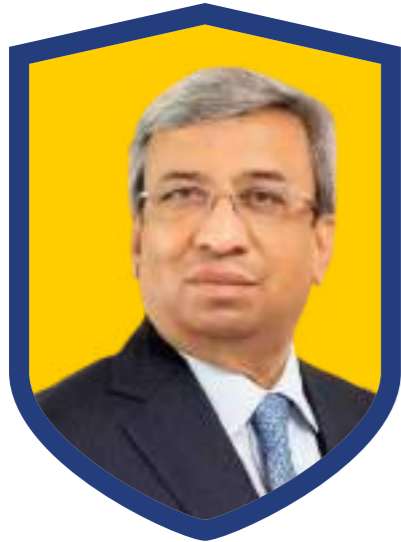
PANKAJ PATEL CHAIRMAN, ZYDUS LIFESCIENCES

A stalwart and a visionary Mr. Pankaj Patel combines both research and techno-commercial expertise. Mr. Patel has been appointed as the Non- Official Director in the Central Board of the RBI. He is on the board of several institutions, including Chairperson of the Board of Governors of IIM Ahmedabad and Chairman of IIM Udaipur and Invest India. He is also a member of the Governing Board of India Pharmacopoeia Commission (IPC), Ministry of Health & Family Welfare, Govt. of India. He is also a Member of the CEO Advisory Committee of International Generics and Biosimilars Association (IGBA). Mr. Patel is a Past President of FICCI.